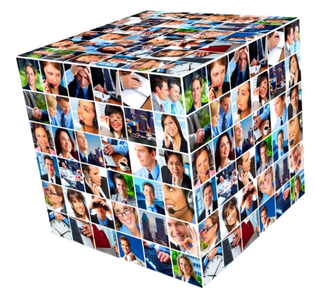
14,000+ investors across North America

World's largest association of active accredited angel investors - www.angelcapitalassociation.org